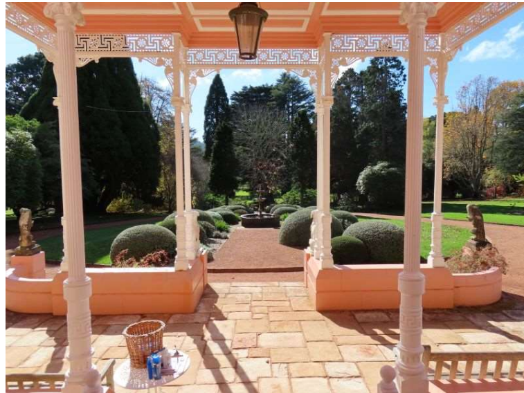
View from the House, Retford Park