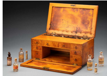
Apothecary's Box made from Huon Pine, NMA Collection